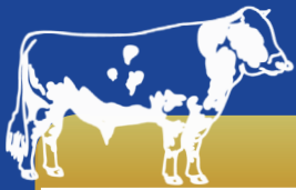
Chart 1: Livestock Marketed Index 2010 = 100