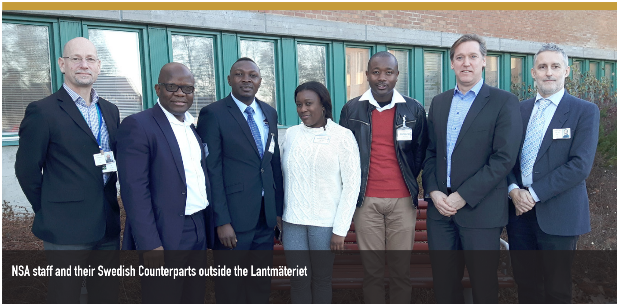
NSA staff and their Swedish Counterparts outside the Lantmäteriet

Narrowing the information gap between producers and users of spatial data in the country