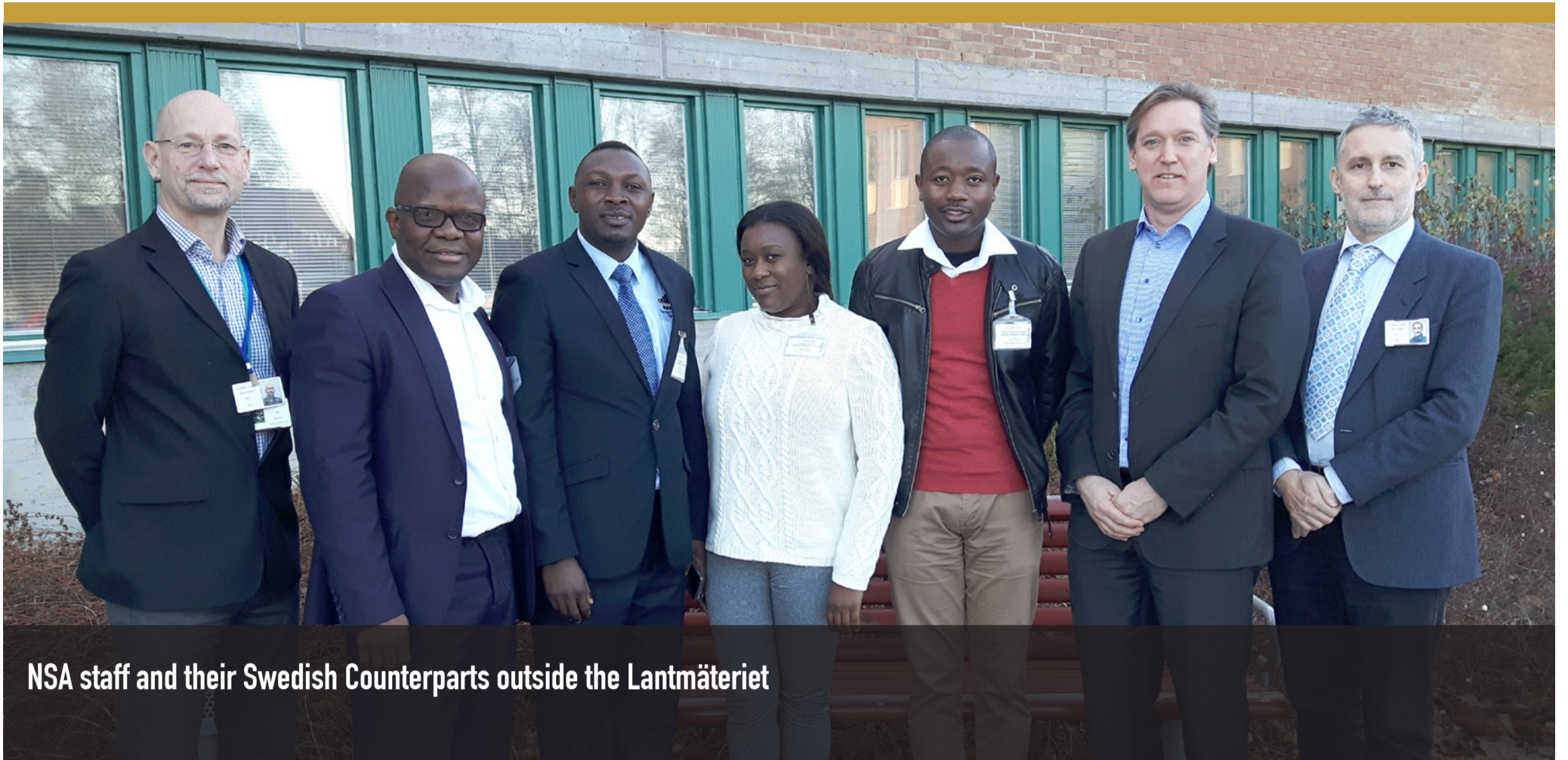
NSA staff and their Swedish Counterparts outside the Lantmäteriet

Narrowing the information gap between producers and users of spatial data in the country