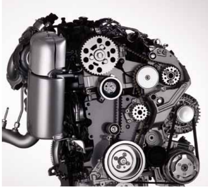
The new generation 16-valve petrol engines are available in 1.4 and 1.6 derivatives. These multi-valve petrol engines offer improved torque delivery, reducing fuel consumption and CO 2 emissions.