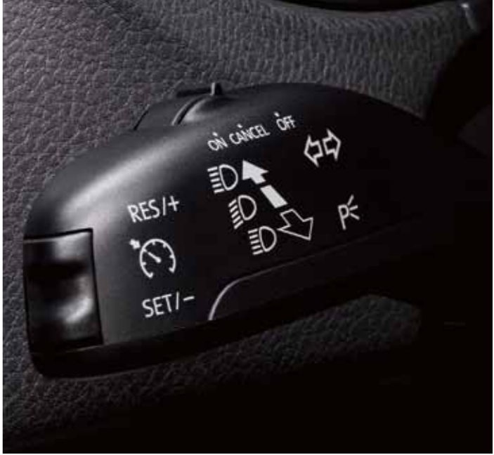
At speeds of over 30km/h, cruise control (standard on the Comfortline) keeps your selected speed constant, enabling you to relax on longer journeys, without having to keep an eye on your speedometer.