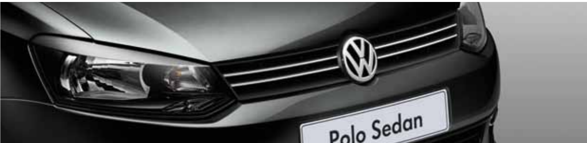
Deep Black Pearl Effect 2T