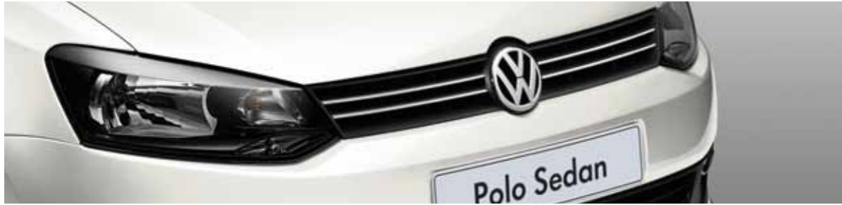
Candy White Non Metallic B4