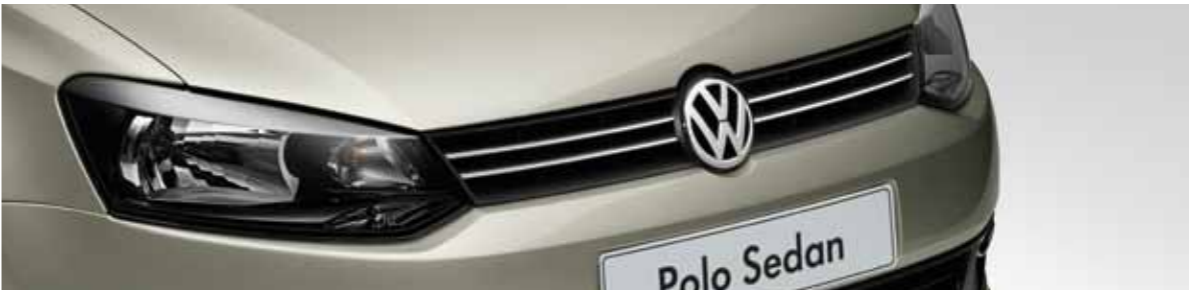
Terra Beige Metallic 4G