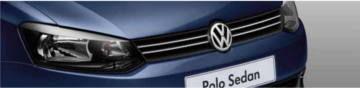
Shadow Blue Metallic P6