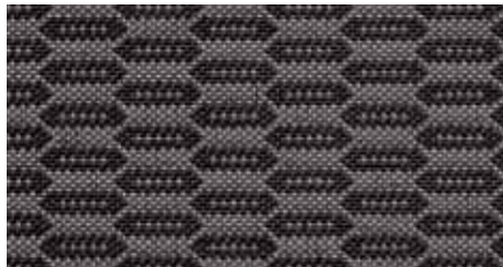
Titan Black 'Metric' cloth Standard on the Trendline.