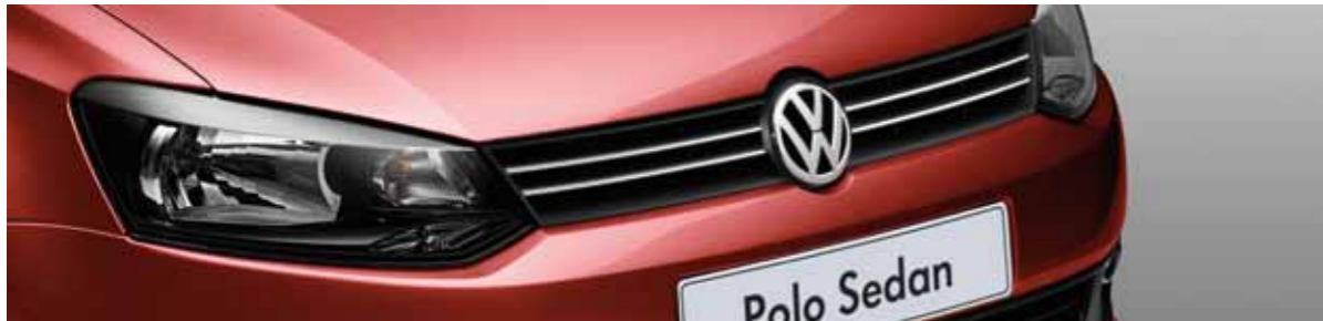
Flash Red Non Metallic D8