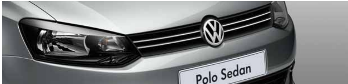
Reflex Silver Metallic 8E