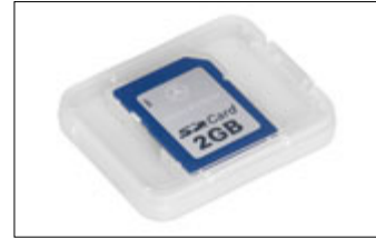
▼ SD memory card, 2 GB