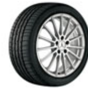
MB multi-spoke wheel, 45.7 cm (18 inch) 6.5 J x 18 ET 38, vanadium silver metallic