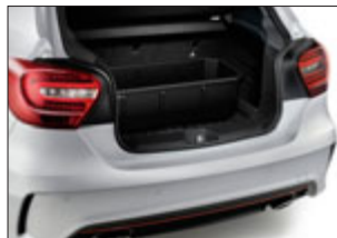
▼ Shallow Boot tub