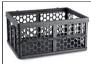
▼ Shopping crate