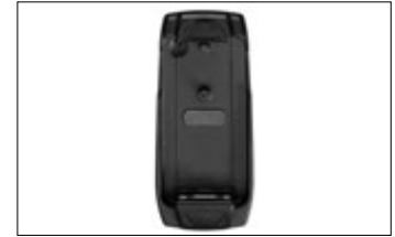
▼ Charging holder with aerial connection for iPhone® 4/iPhone® 4S