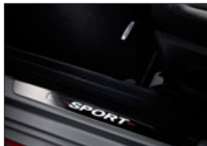
▼ Door sill panel, illuminated