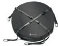
Emergency spare wheel bag