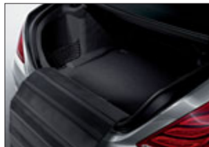
▼ Concertina load sill protector