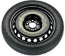
Compact spare wheel