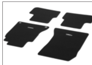
▼ Velour mats Crystal Grey