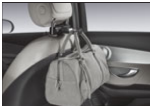
▼ Universal Hook