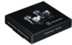
Valve cap, set of 4