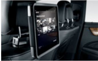
▼ Apple iPad2®-iPad4® Docking Stat., rear, kit