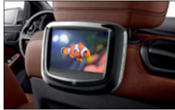
▼ Rear Seat Entertainment System, portable, Kit