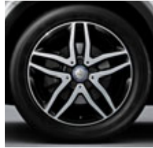
MB 5-twin-spoke wheel, 45.7 cm (18 inch), high sheen 7 J x 18 ET 46, black