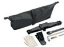
Vehicle tool kit