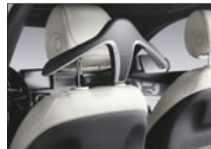
▼ Coat Hanger