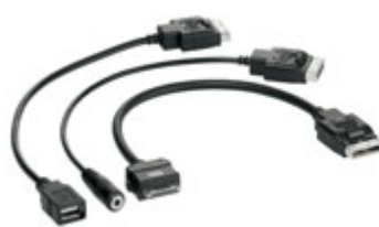
▼ Media Interface consumer cable kit