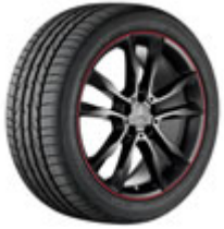
MB 5-twin-spoke wheel, 48.3 cm (19 inch), 8 J x 19 ET 43.5, black