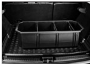
▼ Stowage Crate