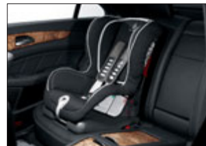
▼ KidFix child seat, with ISOFIX, ECE