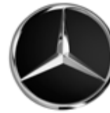
Hub cap, raised star, 2-piece