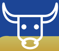
Table 1: Number of livestock marketed ('000)