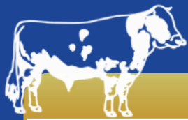
Table 2: Composite Index of Livestock Marketed