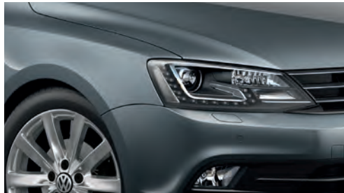
Platinum Grey Metallic 2R2R