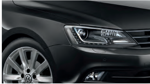
Deep Black Pearlescent Metallic 2T2T