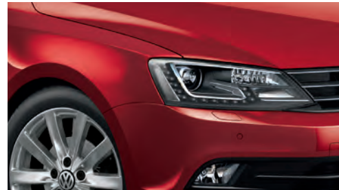
Ruby Red Metallic 7H7H