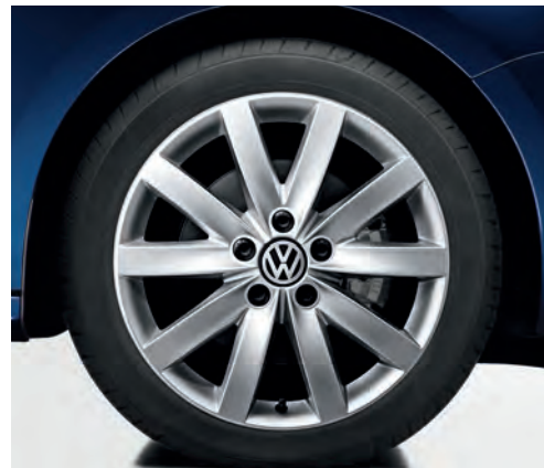
'Porto' 7J x 17" alloy wheels with 225/45 R17 tyres and anti-theft wheel bolts. Standard on Highline.