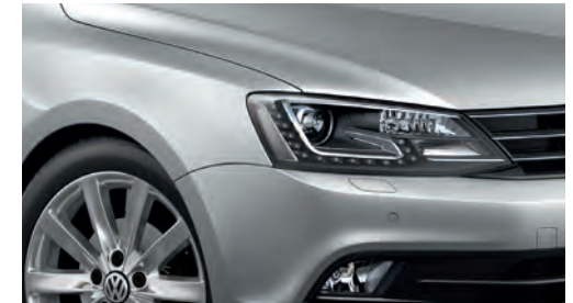
Reflex Silver Metallic 8E8E