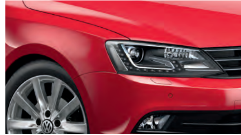
Tornado Red Non-Metallic G2G2