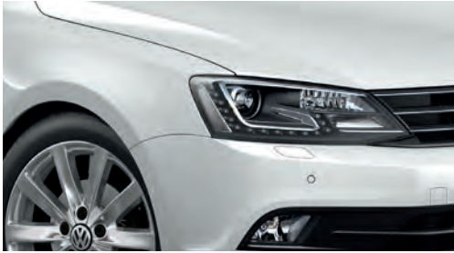
Pure White Non-Metallic 0Q0Q