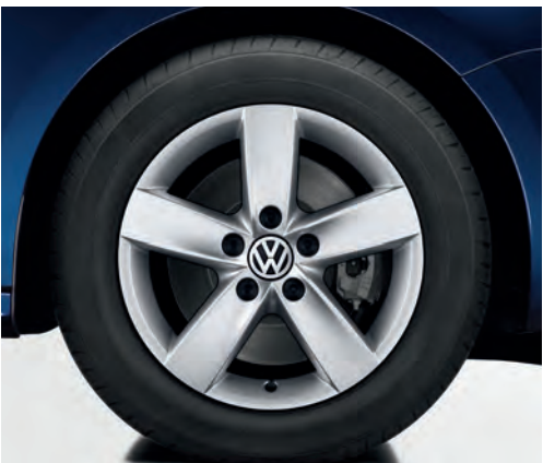
'Navarra' 6.5J x 16" alloy wheels with 205/55 R16 tyres. Standard on Trendline.