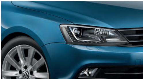
Blue Silk Metallic 2B2B