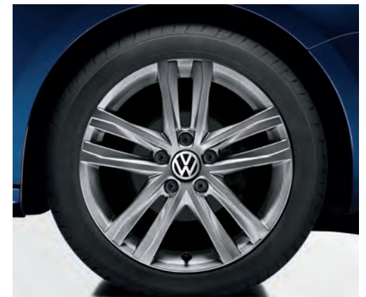
'Lancaster' 7J x 17" alloy wheels with 225/45 R17 tyres. Optional on Comfortline.