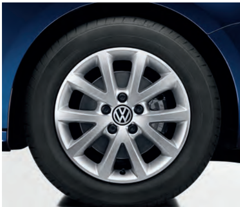
'Sedona' 6.5J x 16" alloy wheels with 205/55 R16 tyres. Standard on Comfortline.