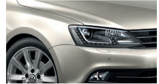
Moon Rock Silver Metallic 0B0B