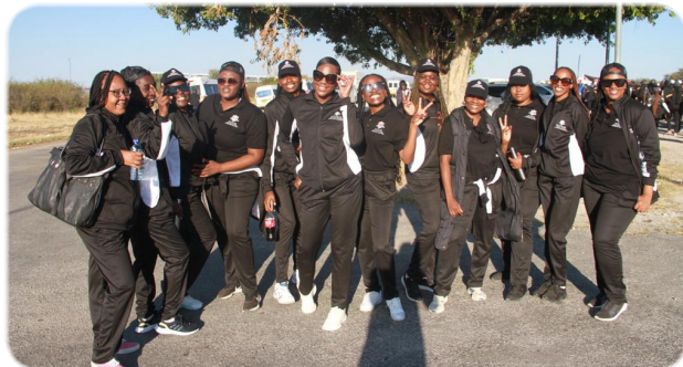
NIPAM Staff Members at the Annual PE Games

The Namibia Institute of Public Administration and Management (NIPAM) recently participated in the highly anticipated 08th Public Enterprises (PE) Games held in Rietfontein at the National Youth Service Rietfontein Training Centre in Otjozondjupa Region.