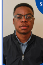
Information Communication Technology Intern